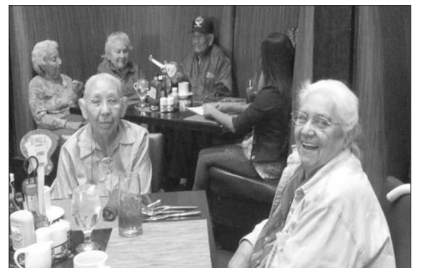
Showing the Elders some appreciation by taking them out to lunch at the Tiwa

In appreciation to our elders we treated them to lunch at the Tiwa at the Hard Rock Casino and Hotel. It was a pleasure to visit with them we enjoyed good food and laughs. We are looking forward to doing this again real soon.