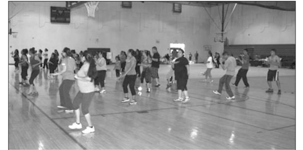
Our Mother's Day Zumbathon at the Isleta Recreation Center

Hinkle Family Fun Center and of course Furr's Buffet! Students who earned their 25 points for reading and/or doing their homework were able to attend the field trip. Great job on your hard work all year. We can't wait until the next school year for more fun incentive field trips. Have a happy and safe summer.