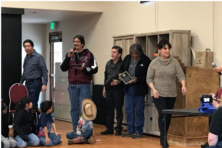
Far Left Photo: Members of the Big Game Management Committee speaking after receiving their plaques of appreciation.